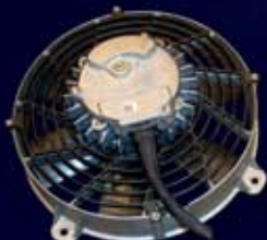
F-11 ELECTRIC FAN