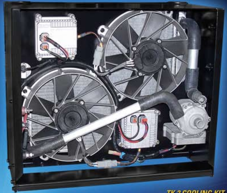
TK 2 COOLING KIT