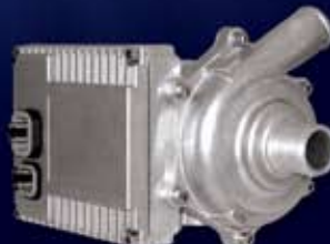
WP29 WATER PUMP