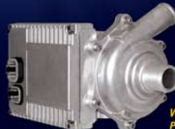
WP29 WATER PUMP (OPTIONAL)