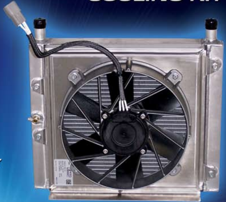
TK 1 COOLING KIT