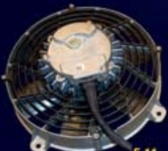
F-11 ELECTRIC FAN